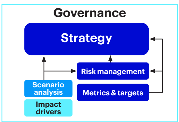
How the TCFD pillars inform decision making